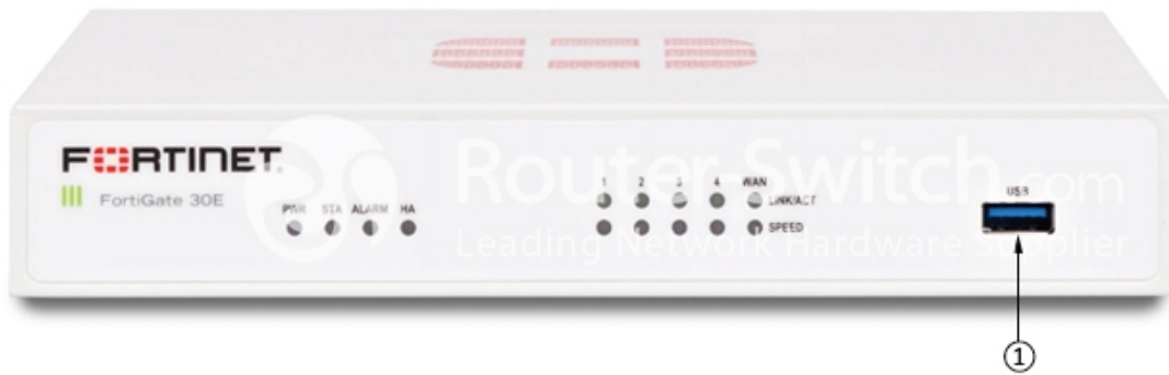
Figure 1 shows the front view of FG-30E.