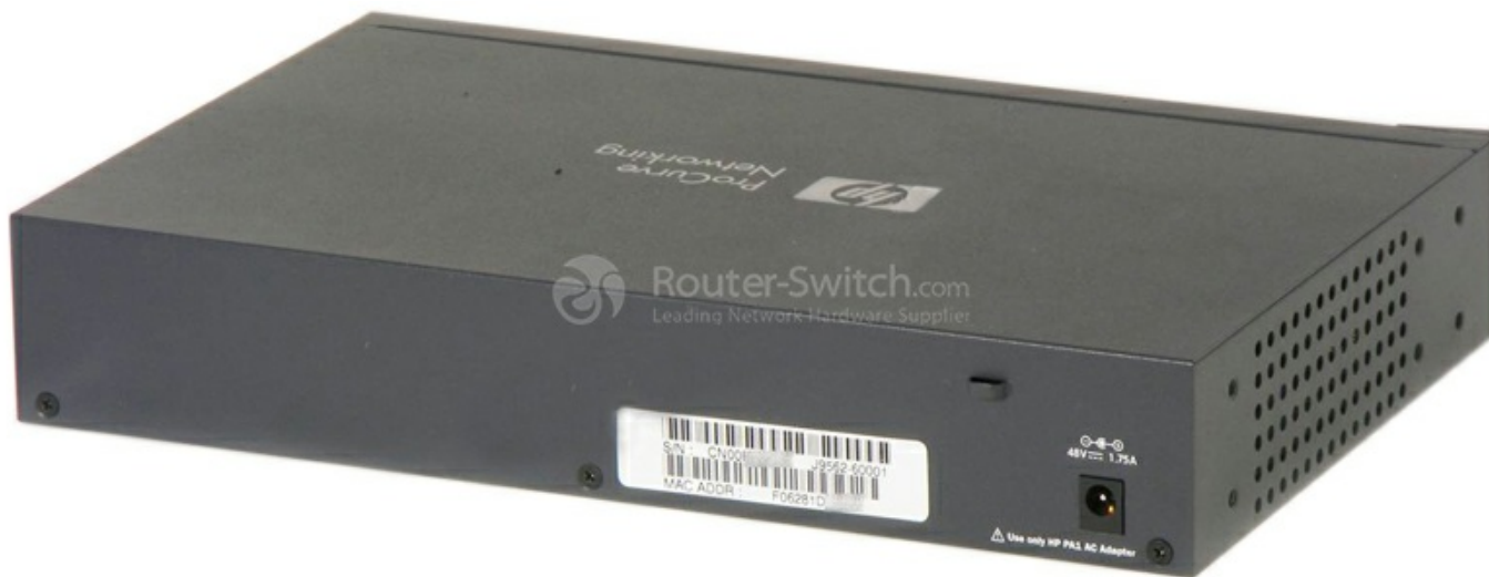
Figure 3 shows the back panel of HPE Aruba J9565A.